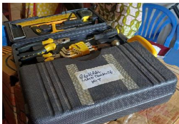
Tools arrive from the charity Worked