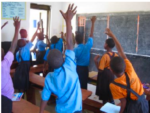
Observing lessons during our trustee visit