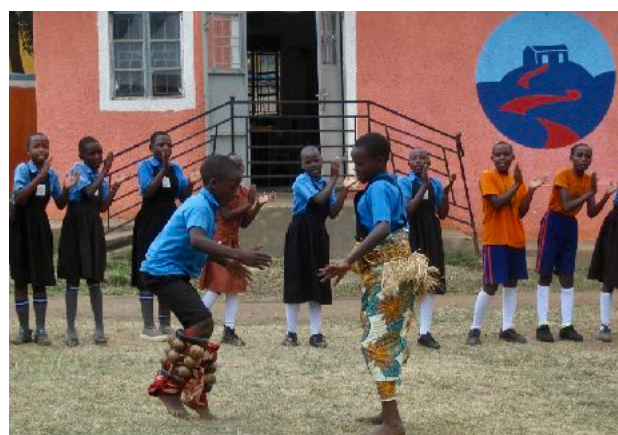
Dance display at Kindergarten graduation