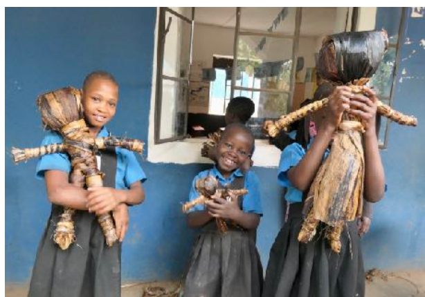
Younger pupils learn to make banana fibre dolls