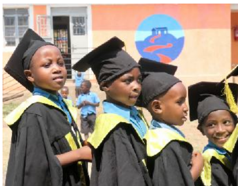
Kindergarten graduation 2025