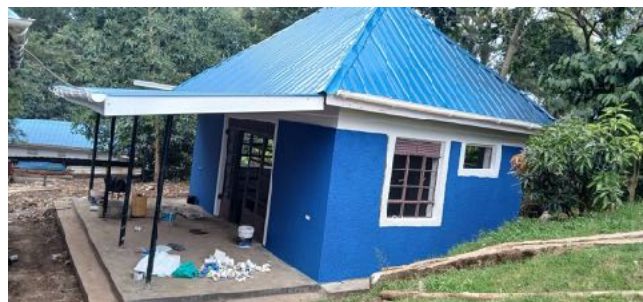
Vocational workshop building completed