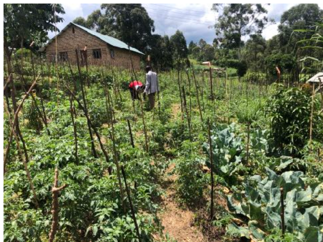
School vegetable garden continues to thrive