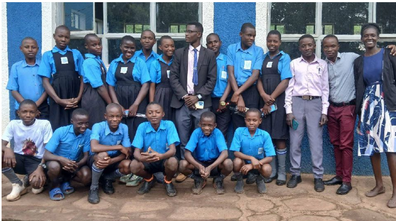
Primary 7 Examination Candidates with their Teachers, November 2025