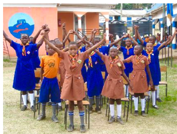
Uphill Brownies & Junior Guides