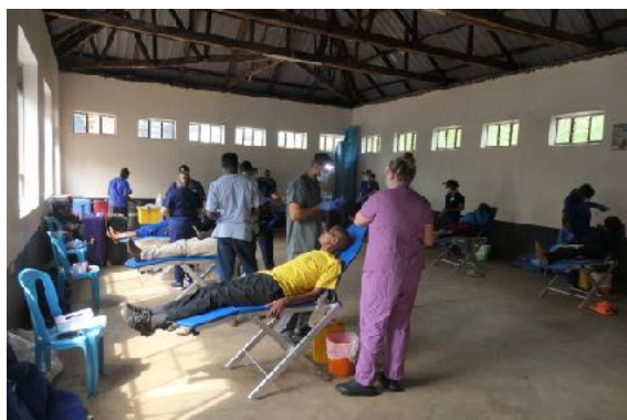
Dentaid visits Uphill & runs clinics in school