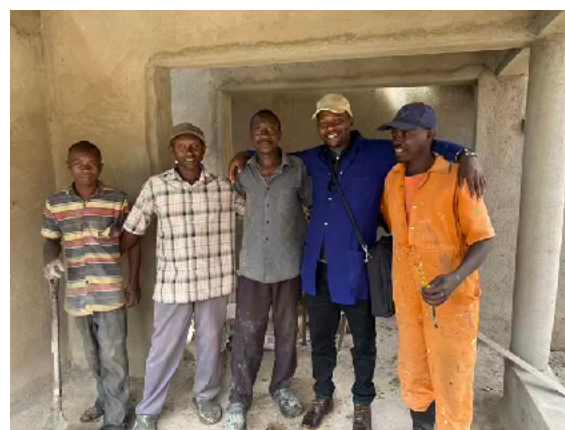
Uphill builders & plumber