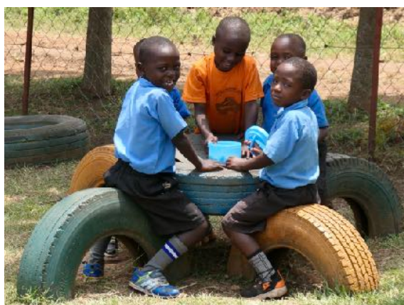
Kindergarten pupils enjoy a mealtime chat