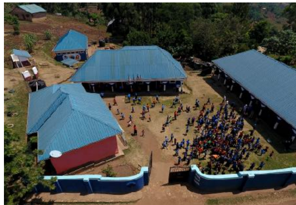
Aerial view of main school compound