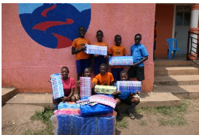
Donation of toothbrushes & mugs from local supporter