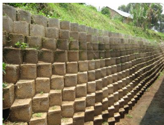
Retaining walls installed to control water erosion