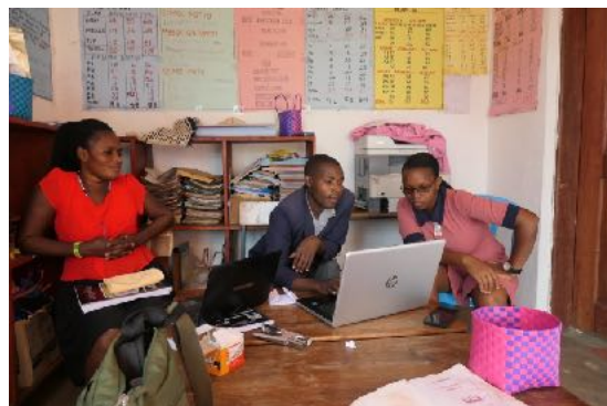
IT training for staff