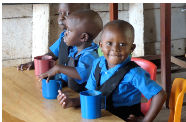
A daily mug of porridge for every pupil