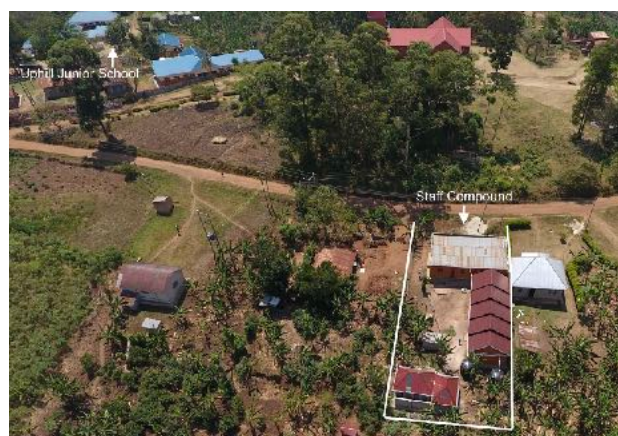
Relative locations of school site & staff compound