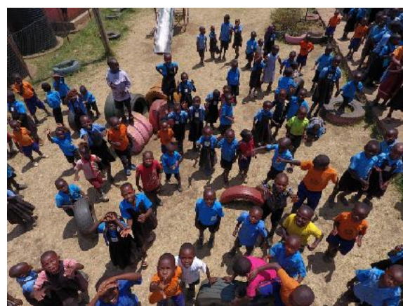
Kindergarten children excited to see the drone