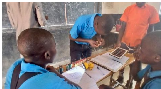
Hands on science experiments for older pupils