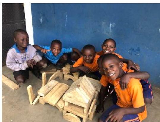
Hands on construction is still a favourite activity