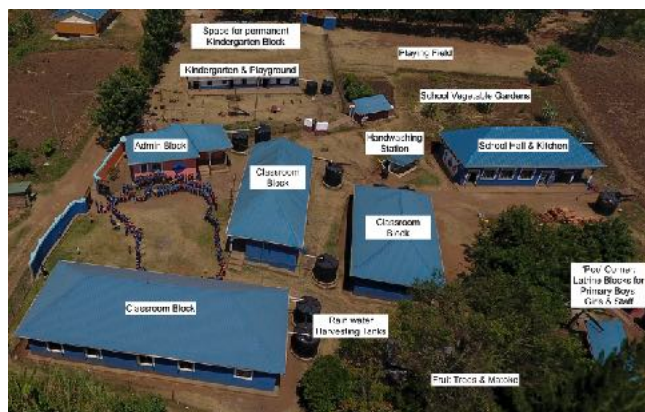
Uphill Junior School site from the air

The whole school community regularly express their gratitude to the Uphill donors who have helped to make this possible.