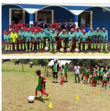
New sport kits is soon put to good use