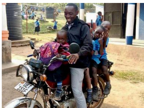
School boda-boda still essential transport