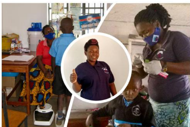
School Nurse is kept busy