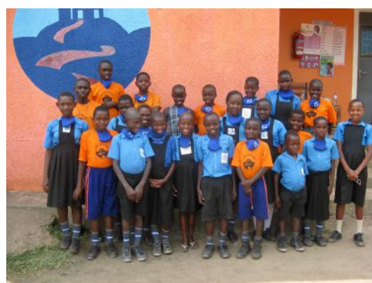
Some of the 28 pupils supported by UK donors