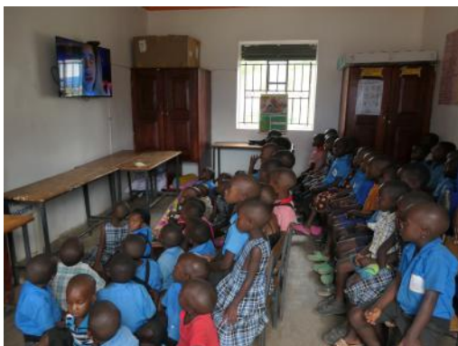
Kindergarten children enjoy a lesson on TV