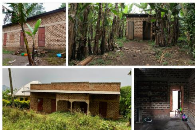
Land and house for staff accommodation