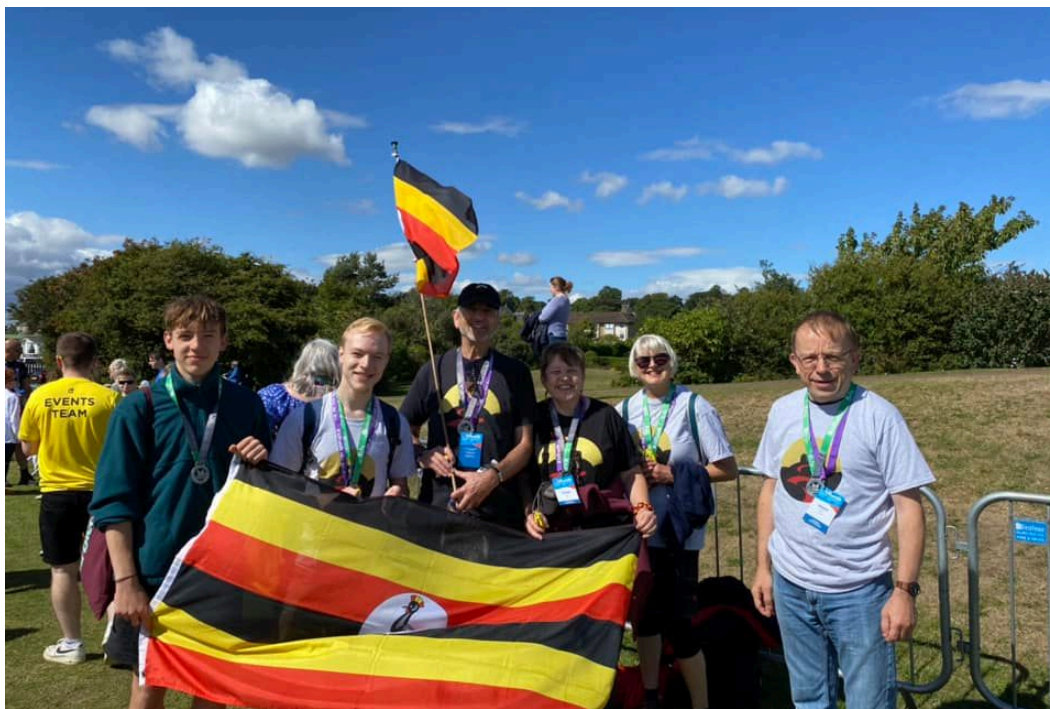
Uphill Kiltwalk Teams in 2022