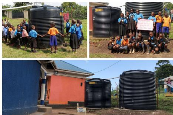
More water storage for the school