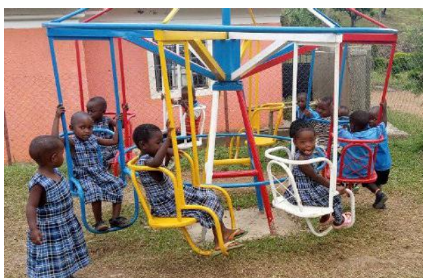
New play equipment for kindergarten