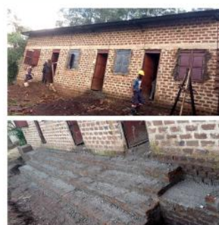
Staff house renovations