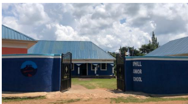
Boundary walls with signage, at long last!