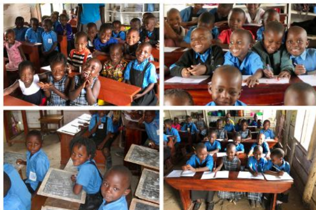
Pupils enjoy the new kindergarten classrooms