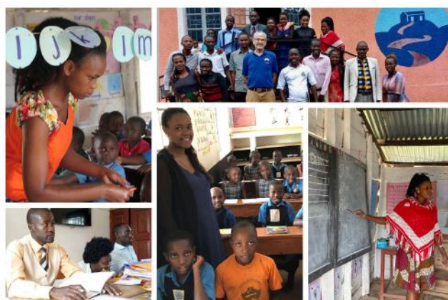
Uphill teaching staff