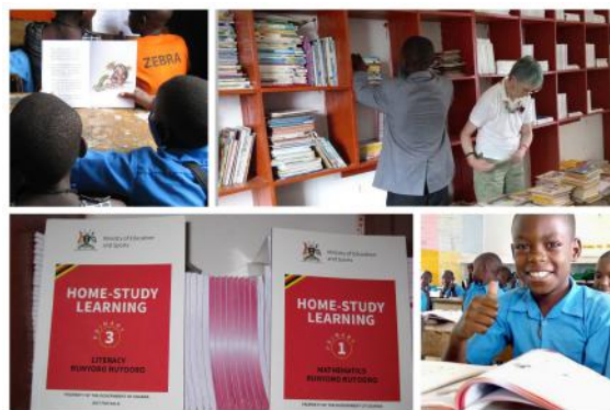
Getting closer to 'One Book, One Child'