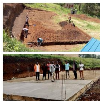
Foundations for the new kitchen-hall building