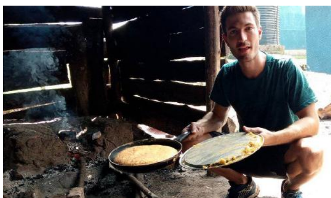
Another Spanish volunteer cooking for the staff