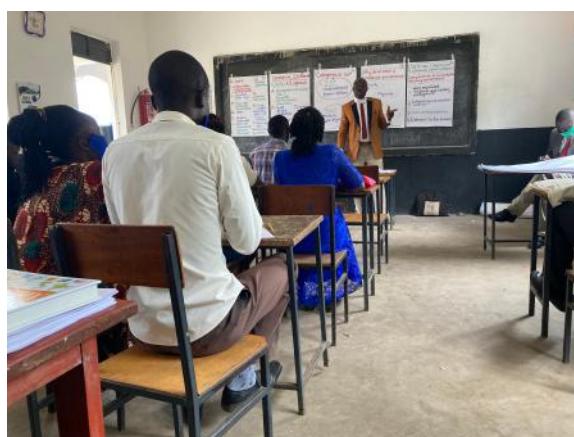
Teachers have lessons too!