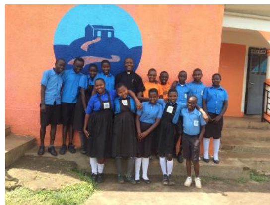
Primary 7 leavers 2022