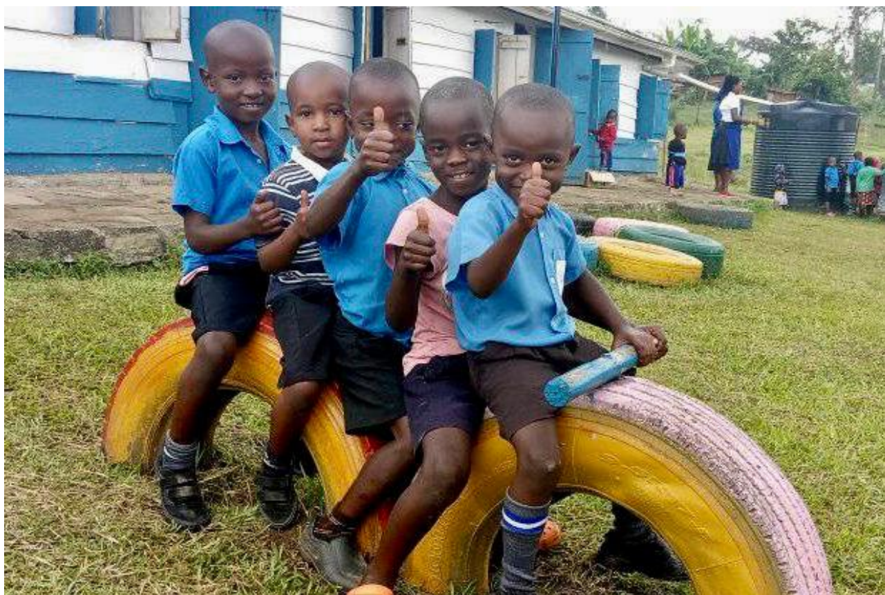
Kindergarten pupils enjoying their new school site in 2022

The Trust supports the day-to-day running of the school and also provides funds for capital projects. The Pupil Support Fund helps severely disadvantaged children attend school. From time to time, when funding is available, additional support is provided to protect health and enhance the quality of life for pupils, staff and the wider community.