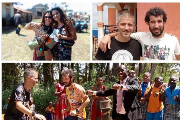
Spanish volunteer teachers spend time at UJS