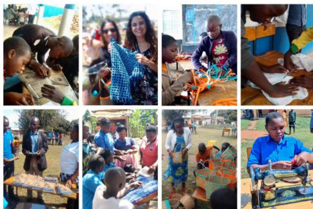
Holiday skills programme in action