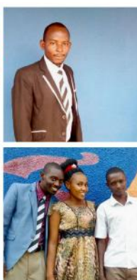
Uphill teachers remain at school to run the homeschooling programme (2021)