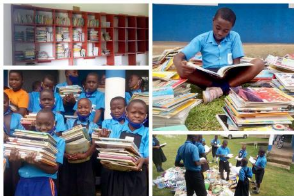
Donated library books & shelving (May 2021)