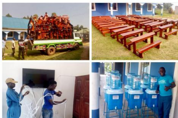
Desks, water filters & satellite television (April -July 2021)