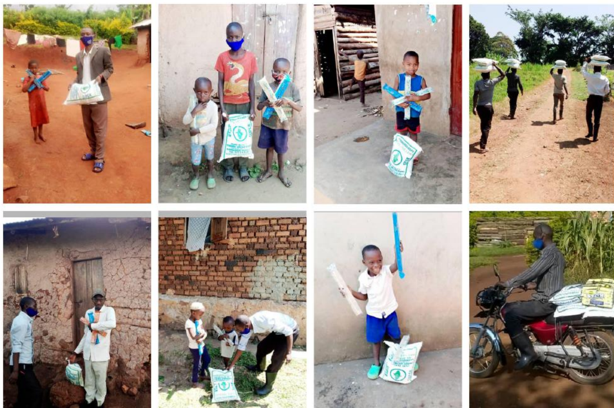
Teachers distribute food aid in the community in July 2021

As in 2020, we funded lockdown food aid and soap for Uphill families and for elderly and disabled households in the wider community. We also helped by paying for the teachers' rent and food, enabling them to remain in Iruhuura and run the homeschooling programme whilst the school was closed.