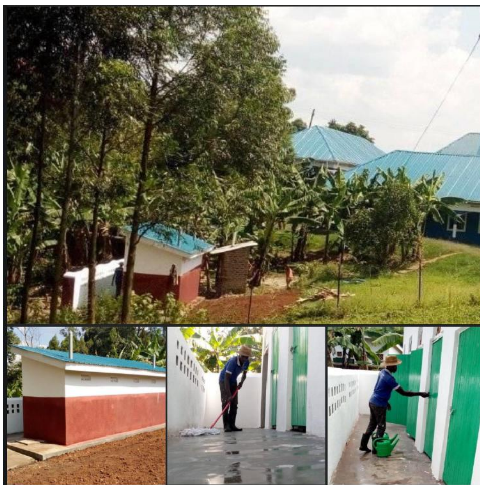
Boys Latrine funded by a grant from Meeting Needs