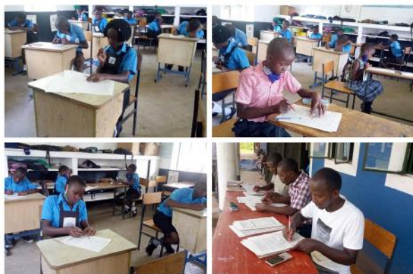
Primary 5 & 6 return to school for 3 months (March-May 2021)