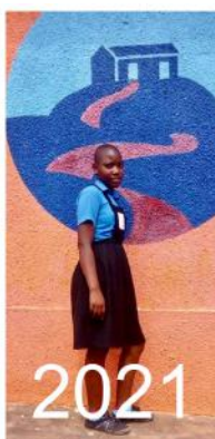
One of the first pupils to be supported by the Trust finishes primary education (March 2021)