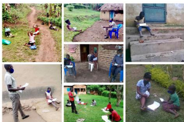
Home schooling programme continues during second lockdown (June-December 2021)