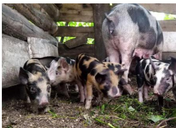
Uphill piggery, before African Swine Fever infected the stock (January-November 2021)