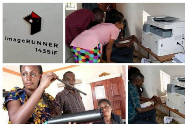
Photocopier & staff training (October 2021)