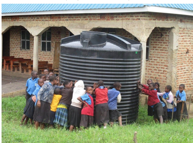
Large water tanks arriving for rainwater harvesting for classroom block (November 2016)