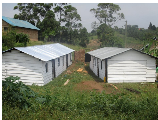
Relocation/extension of wooden school building for temporary classrooms on new site (December 2016)