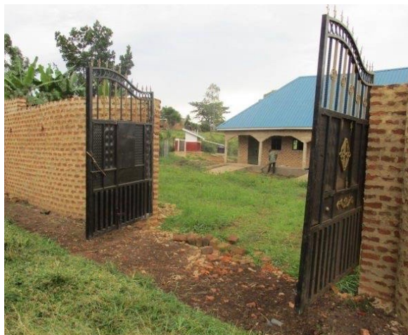
Main entrance gate (also small gate at rear of site) (September 2016)