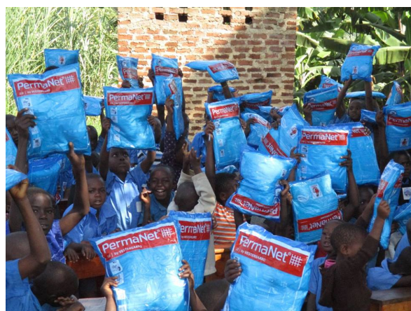
Medical grade mosquito net for each pupil and teacher, with usage/care training ( June 2016 )