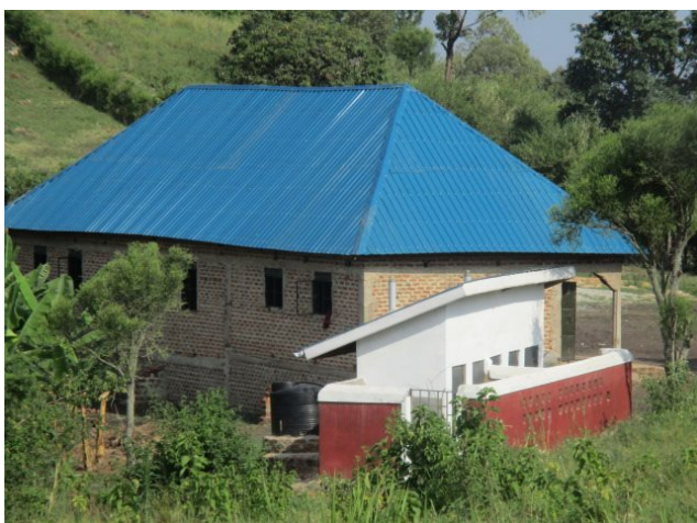
Latrine block ( completed February 2016 ) with classroom block behind ( construction completed August 2016; plastering/painting January 2017 )

The Chairman plans to make at least two visits to UJS in 2017 to monitor progress.