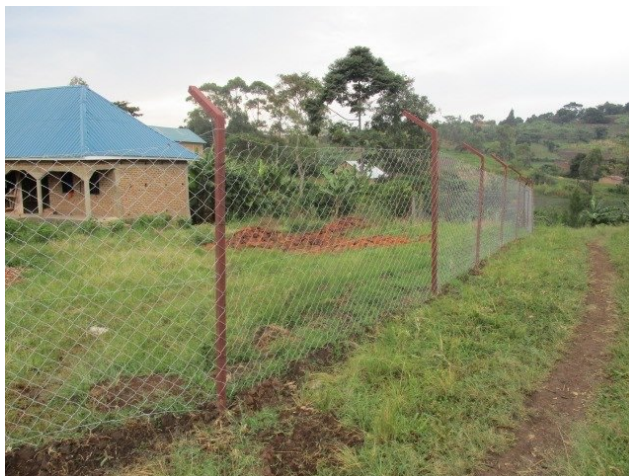
Security fence encloses the two plots of land that make up the new school site (September 2016)