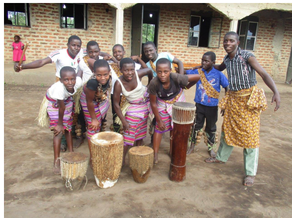
Pupils with cultural costumes and instruments outside new classrooms (November 2016)