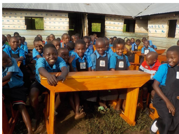
New desks provided with funds raised by Scottish school pupils ( April 2016 )