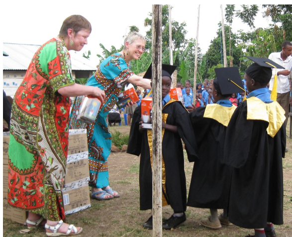
Trustees handing out solar lanterns at the kindergarten graduation ceremony ( March 2016 )