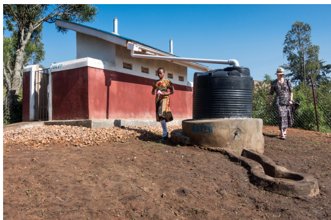
Rainwater harvesting system for latrine block (September 2016)