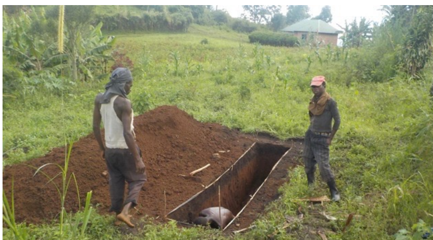
Starting to dig the latrine pit in December 2015: 12 ft long x 43 ft deep