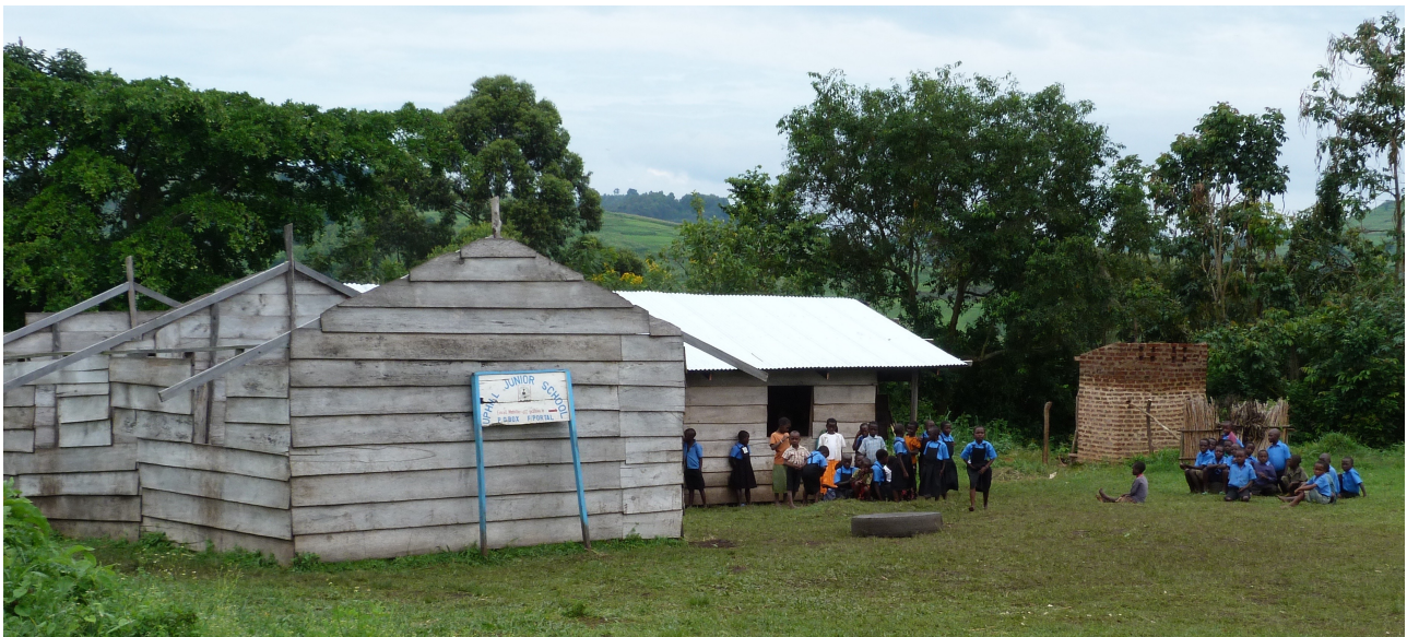
Uphill Junior School, as it was first seen, in October 2012

The Trustees intend to continue paying the teacher's salaries and other running costs not met by the school fees collected by Uphill Junior School (as agreed on a needs-basis with the Director). The school still has to add two more years groups (Primary 6 and Primary7) therefore both pupil numbers and staffing will increase in 2016 and 2017. The next major project will be the progressive construction of permanent school facilities on the new school site, with the first priority being the building of a 5-stance ventilated latrine block, with hand-washing facilities, for staff and pupils. This project is underway and should be completed by the end of January 2016. The first classroom block, containing 2-3 teaching rooms, is also planned for 2016. Two Trustee visits are planned for 2016, in March and October, to monitor the school development project.