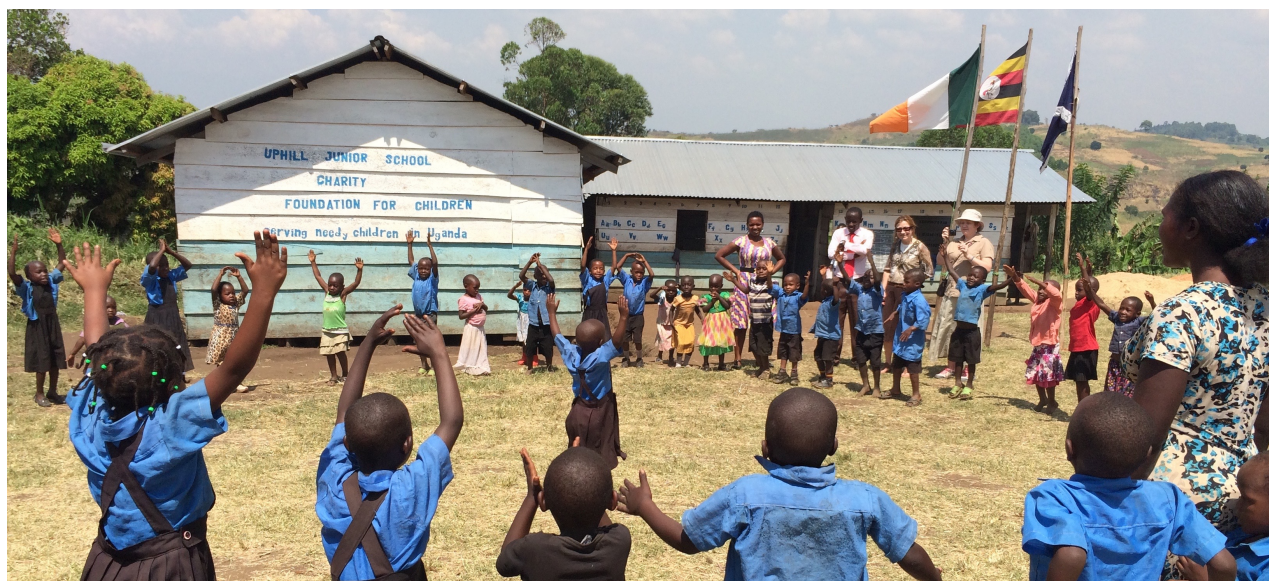
Uphill Junior School, during the Trustee visit in February 2015