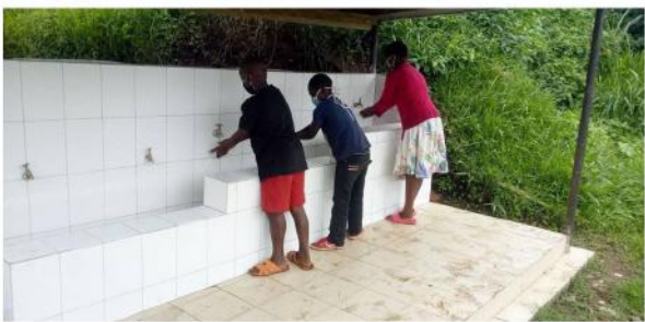
Hand washing station, fed from the school water harvesting system (August 2020)