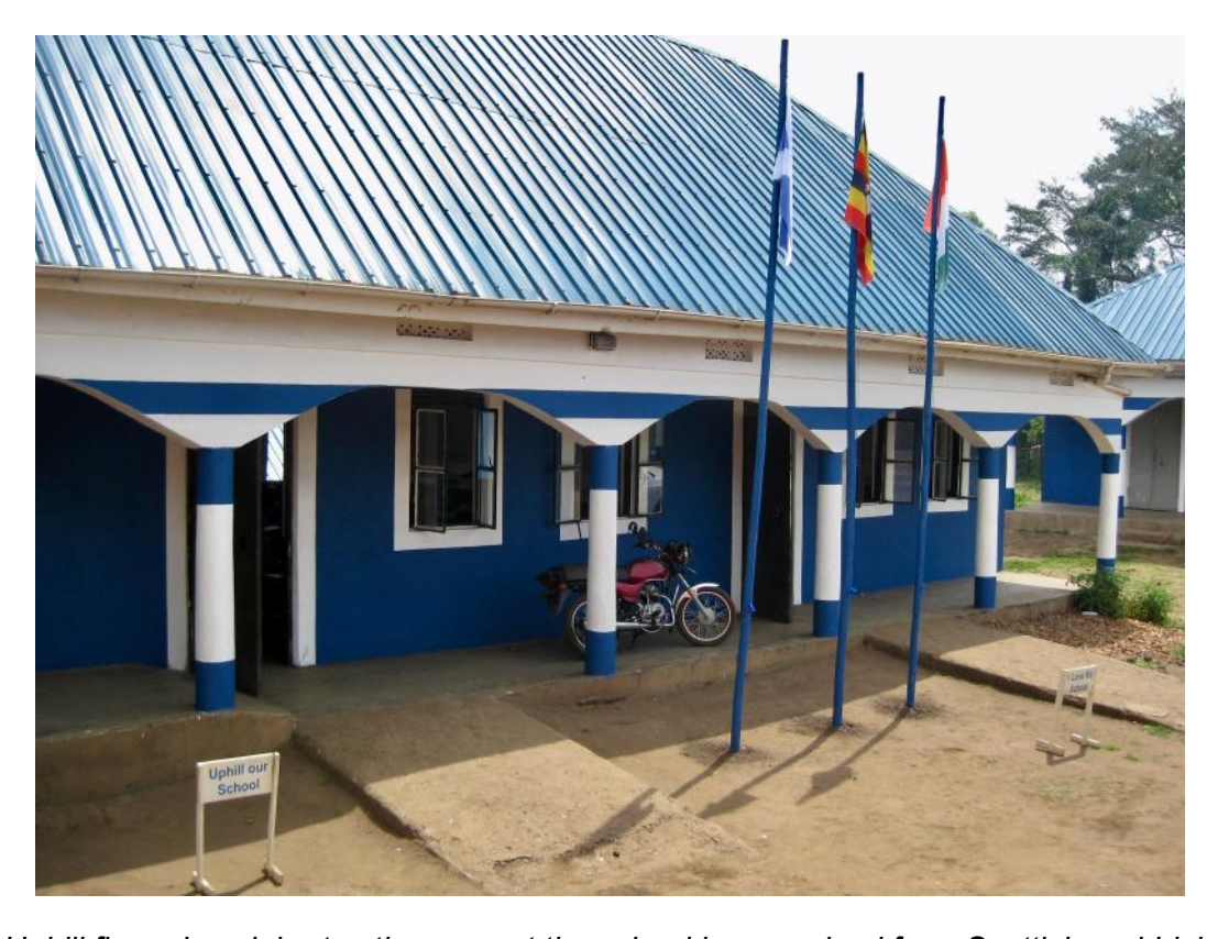
The Uphill flagpole celebrates the support the school has received from Scottish and Irish supporters over the years