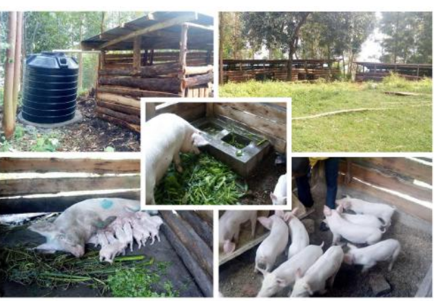
Uphill piggery project: Funding for construction, water harvesting, three pregnant sows & food (July 2020 onwards)