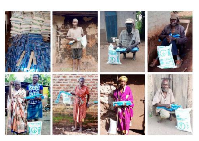
COVID-19 food relief programme for elderly & disabled in wider community (June 2020)