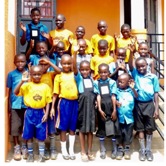
Children attending Uphill with help from the Pupil Support Fund (February 2020)