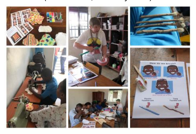
Workshops for staff: Making washable sanitary pad & school toothbrushing programme (Trustee visit, February 2020)