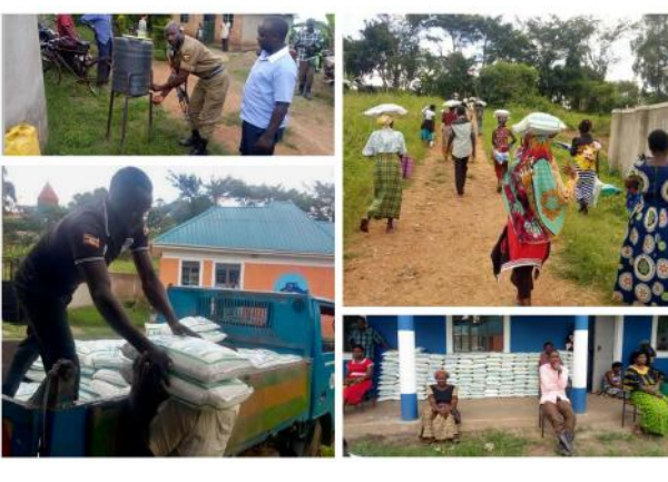
COVID-19 food relief programme for school families (May 2019)