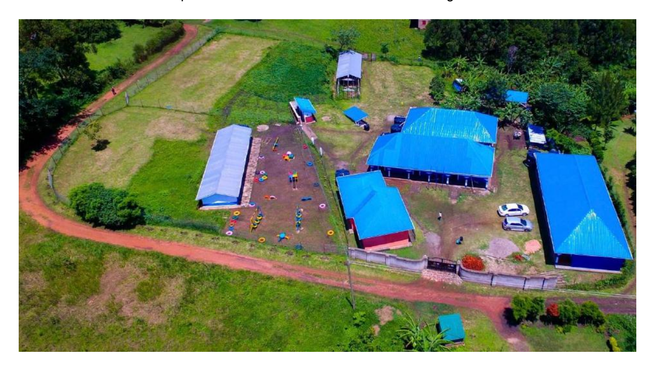
Aerial view of Uphill Junior School in November 2020, showing the newly relocated Kindergarten and playground on the left of the photograph