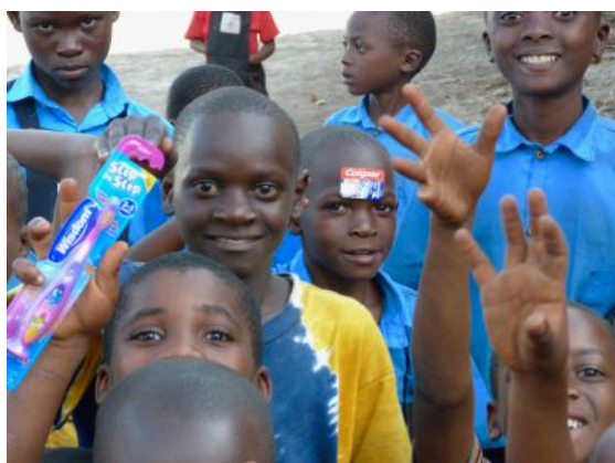
A toothbrush for every pupil (March 2018)