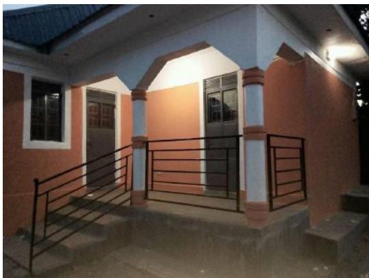
Power for education 1 - Administration Block (June 2018)