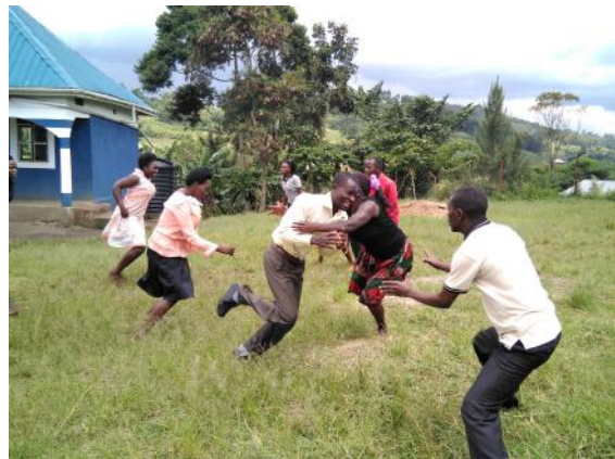
Teacher Development sessions - learning new games for PE lessons (October 2018)