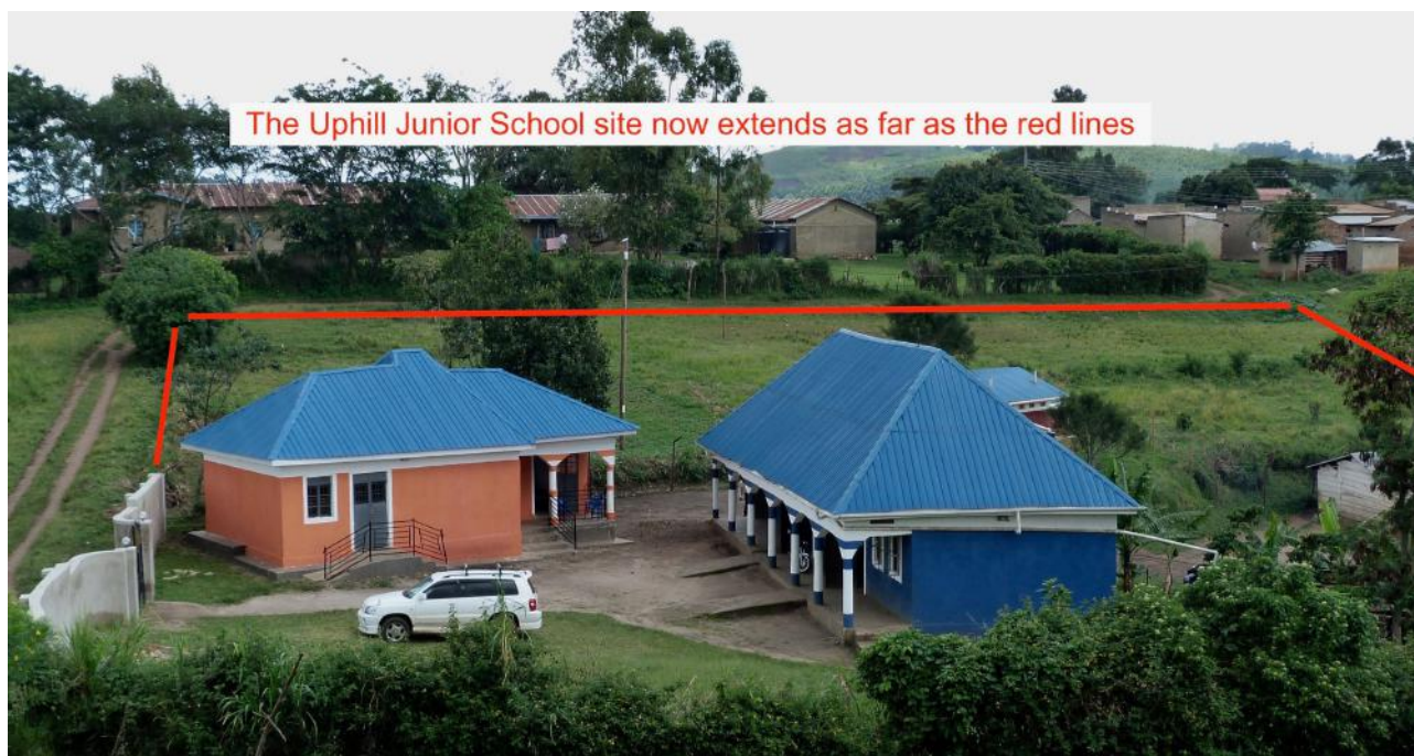
Upper section of school site, showing new Administration Block and the new boundaries following purchase of 2 more plots of land