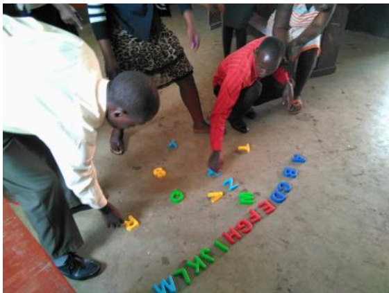
Teacher Development sessions - learning new teaching methods and logic games (October 2018)