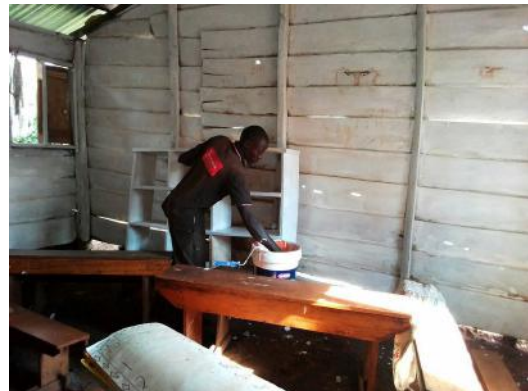
Repainting the inside walls of the temporary classroom blocks ready for 2019 (December 2018)