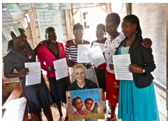
Lower school teacher training in the use of 'big books' for literacy lessons (March 2018)