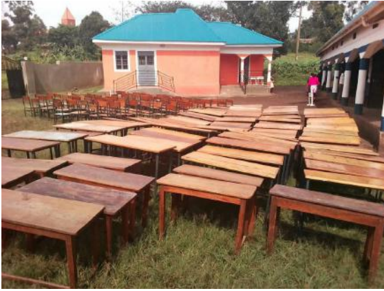
Second hand desks and chairs donated by Rupalia Foundation, Kampala (November 2018)