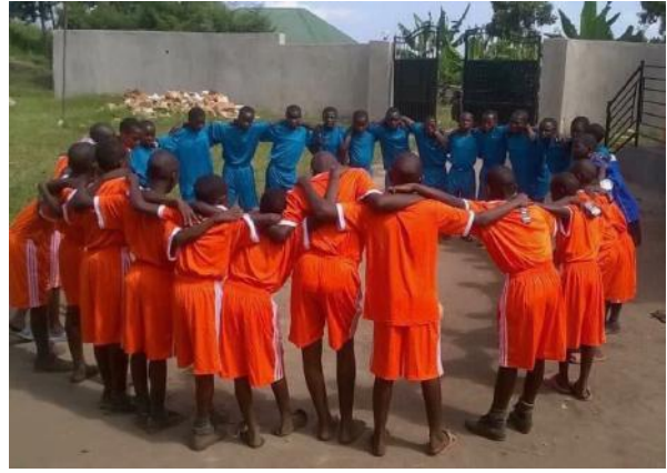
Team uniforms for upper primary children (July 2018)