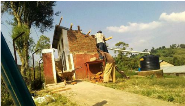
Remedial work on the existing latrine block - bigger 'windows', dealing with pooling water and creating a proper urinal for the boys (December 2018)