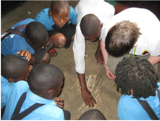
Teaching the older pupils to play indoor games (March 2018)