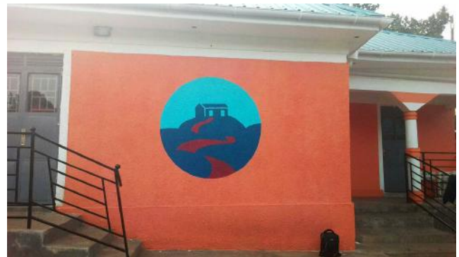
Uphill Junior School logo on the wall of the Administration Block (December 2018)