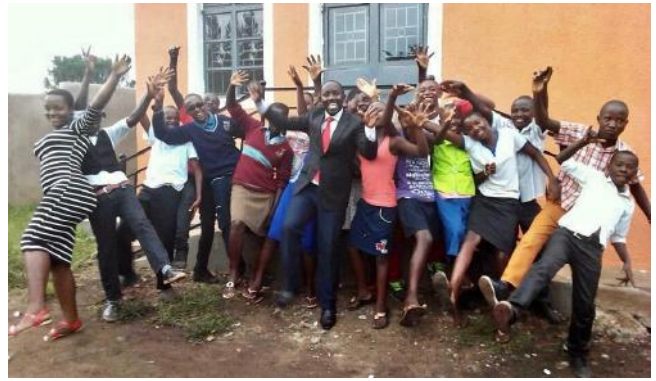
Primary 7 celebrate completing their primary education (November 2018)