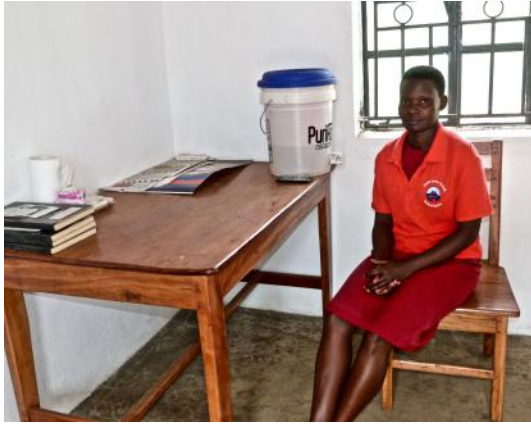
School Nurse in her 'clinic' (June 2018)