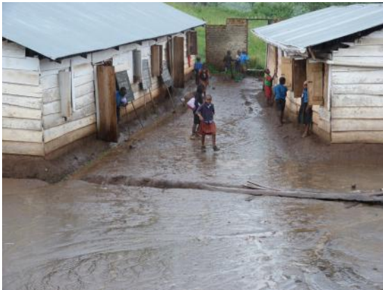
Getting the Uphill children 'out of the mud' remains a high priority (March 2018)