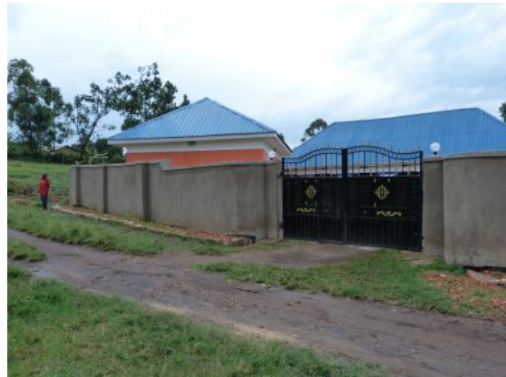
Plastered wall at the main entrance to the school (June 2018)