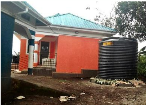
Water harvesting system installed on the new Administration Block (December 2018)