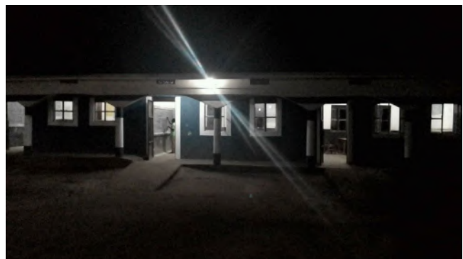
Power for education 2 - Classroom Block (September 2018)