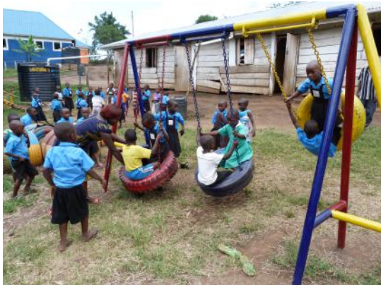
Metal swing frame for kindergarten playground (September 2018)