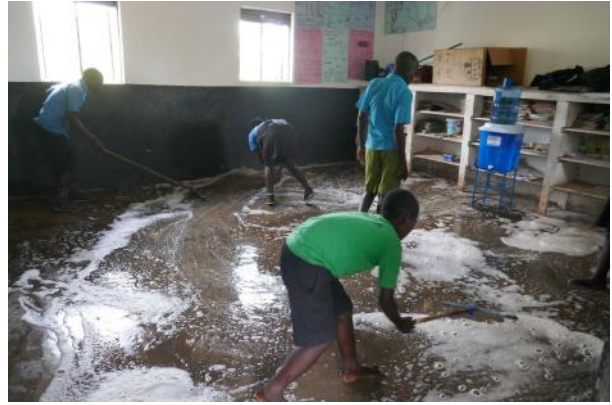
The pupils demonstrate how they keep the school clean (March 2018)