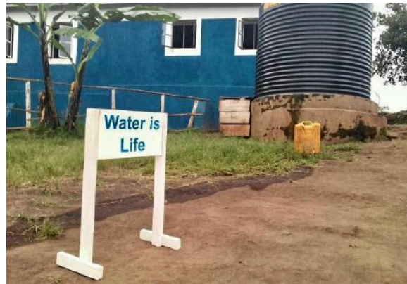
Motivational signs in the school compound (October 2018)